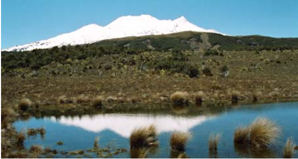
Pic 2: Maunga Ruapehu from Rotokawa