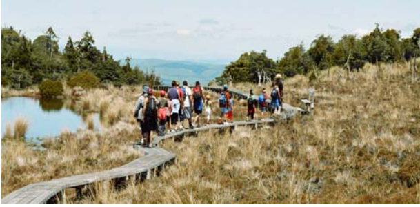
Pic 3: Whānau walking past Rotokawa with Karioi in the distance.