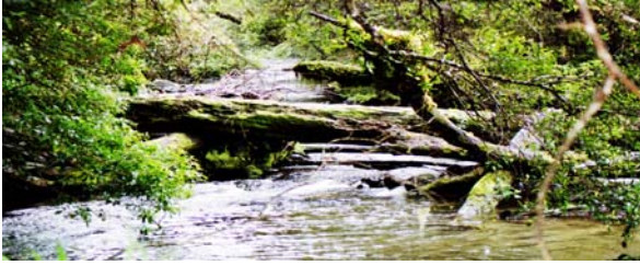
Pic 4: Mangawhero River, Mt Road, Ohakune