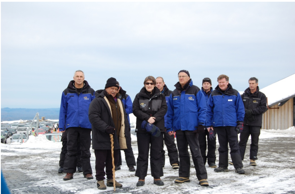
The late Rangitihī Tahupārae and the former NZ Prime Minister Helen Clarke

Opening of new chairlift, Tūroa Skifields, Mount Ruapehu